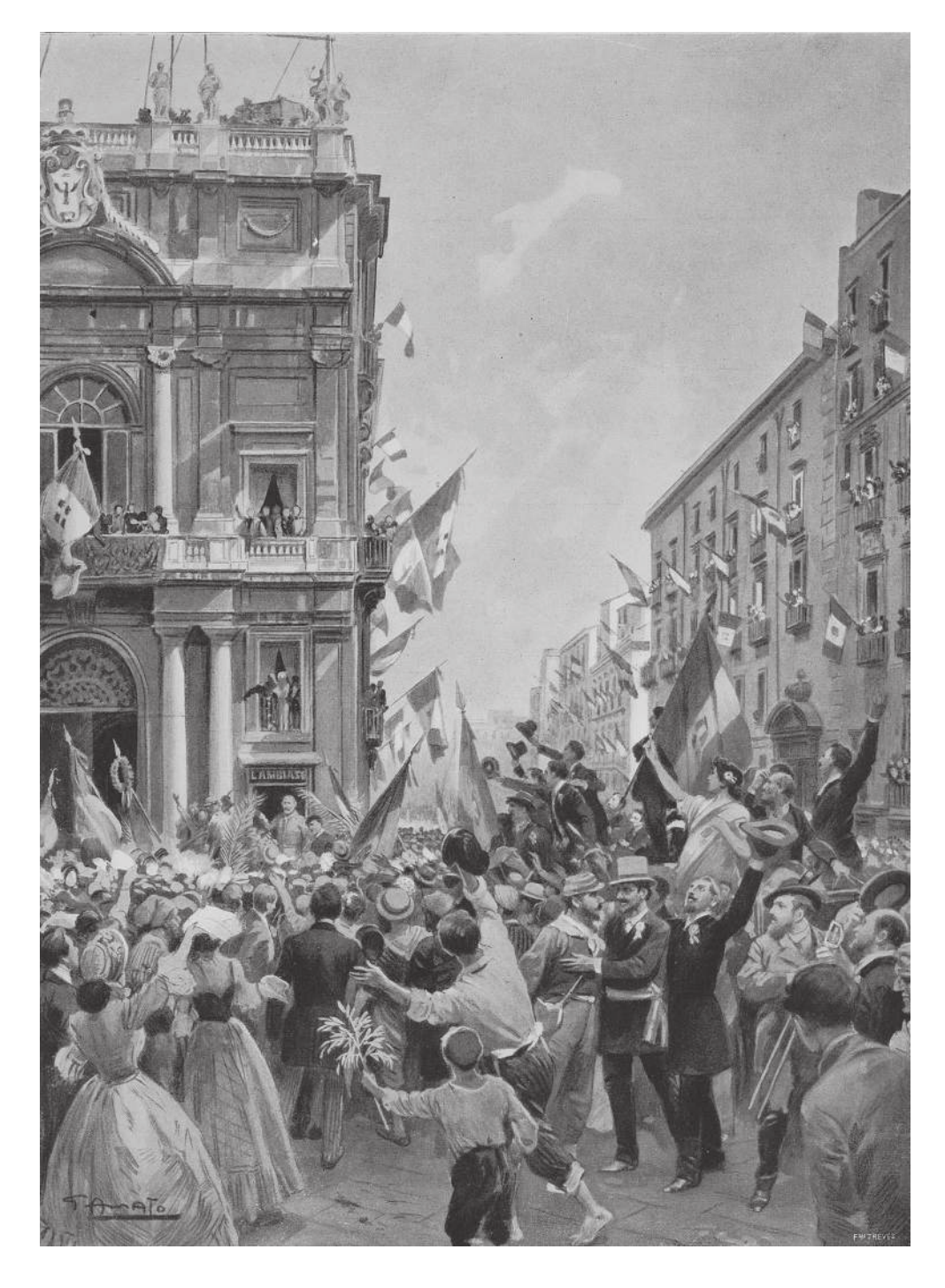
An Italian drawing from 1910 of Garibaldi announcing from a balcony in Naples the annexation of the Kingdom of the Two Sicilies to Italy in September 1860.