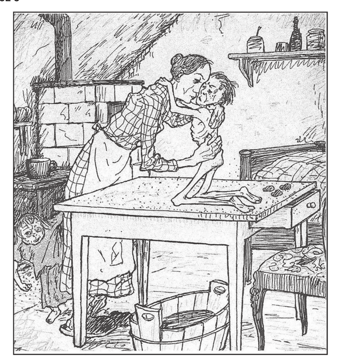
A cartoon entitled 'Consolation' published in a German magazine, 24 June 1919. The mother is saying to her child, 'When we have paid 100,000,000,000 marks, then I shall be able to give you something to eat.'