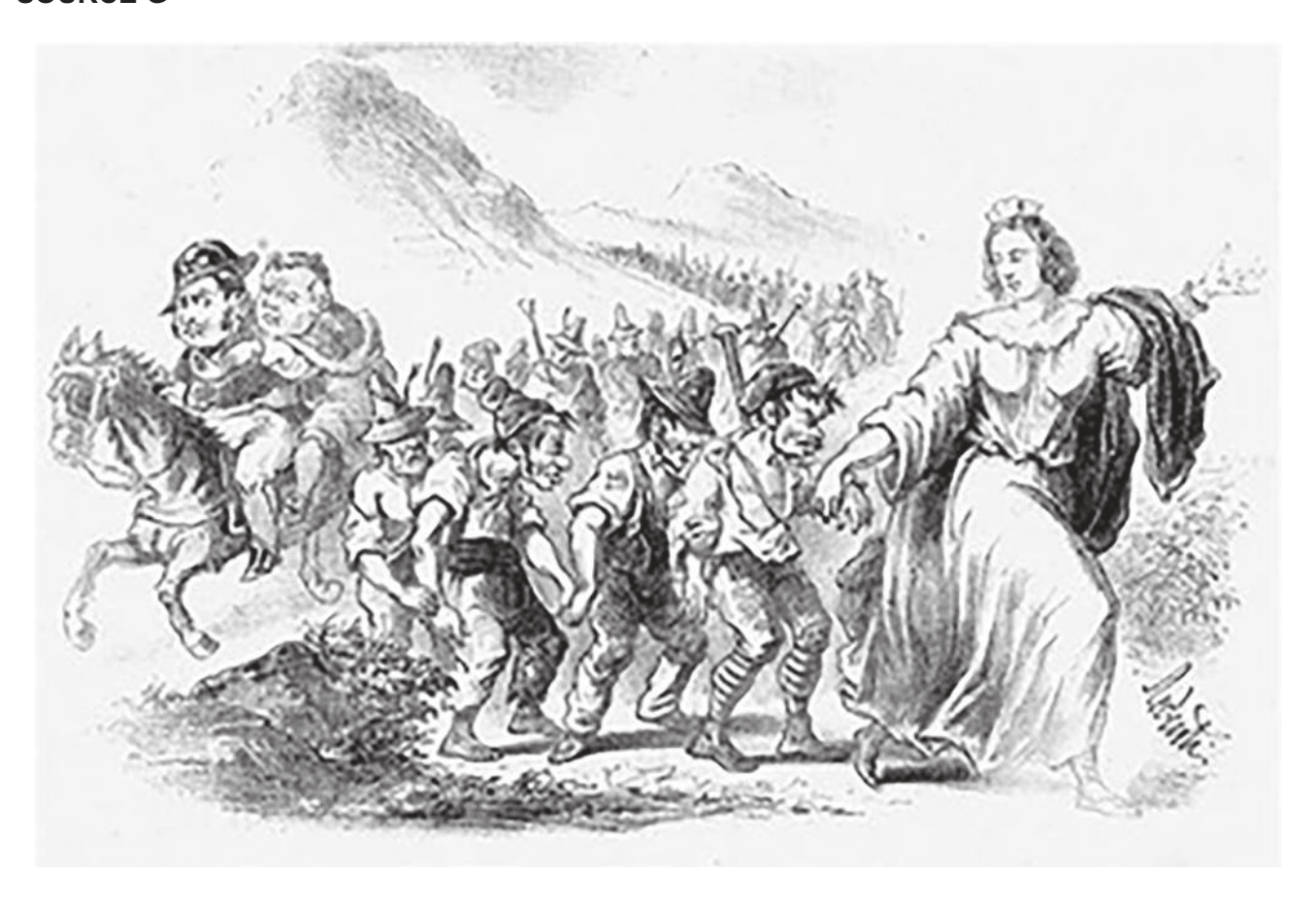
A cartoon published in a liberal northern magazine in 1861. It shows the spirit of Italy leading bandits from the South out of the Kingdom of Italy. The figures escaping on horseback are Francis II, King of the Two Sicilies, and Pope Pius IX. The spirit of Italy is saying to the bandits, 'Away from here, wretches! Your masters trot along on one side and you on the other side, both you and they no longer have the right to call yourselves sons of Italy!'